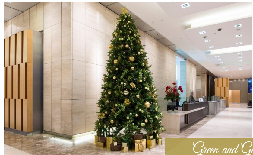
Green and Gold