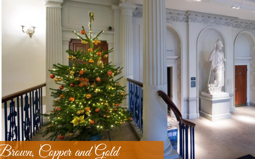
Brown, Copper and Gold