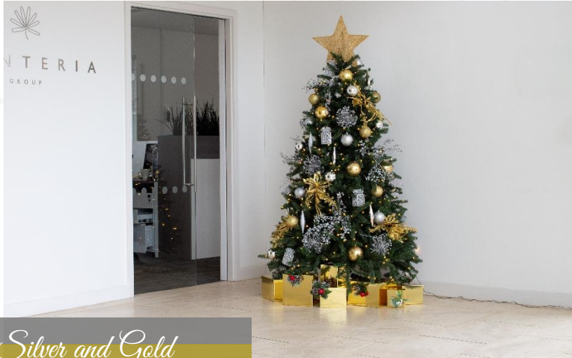
Silver and Gold