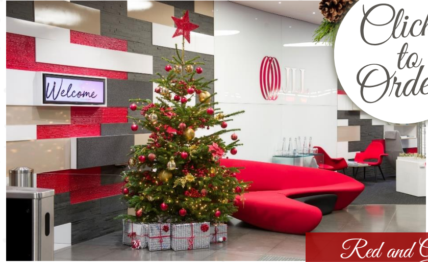
Red and Gold