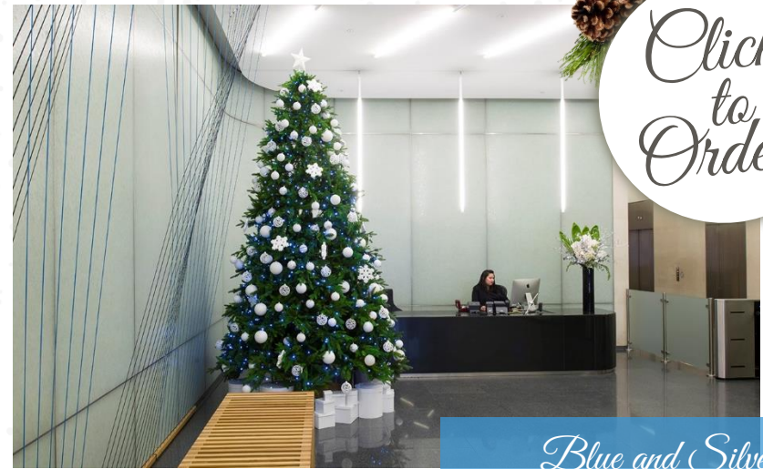
Blue and Silver