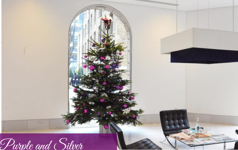
Purple and Silver